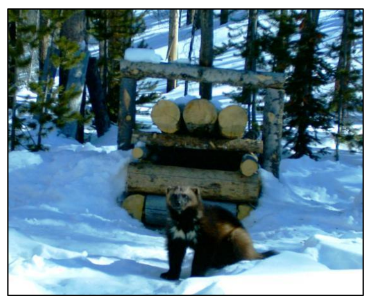
A wolverine at one of our 2011 pre-baited log-style traps on the Sawtooth National Forest. The lid is locked open, so he was free to come and go as he pleased last winter. He was certainly surprised this winter when the lid closed. He is now wearing a GPS collar for 3 months as one of our Stanley study area animals.

Idaho Public TV filmed our project for a segment of the Outdoor Idaho program "Working for Wildlife": http://idahoptv.org/outdoors/shows/ workingforwildlife/