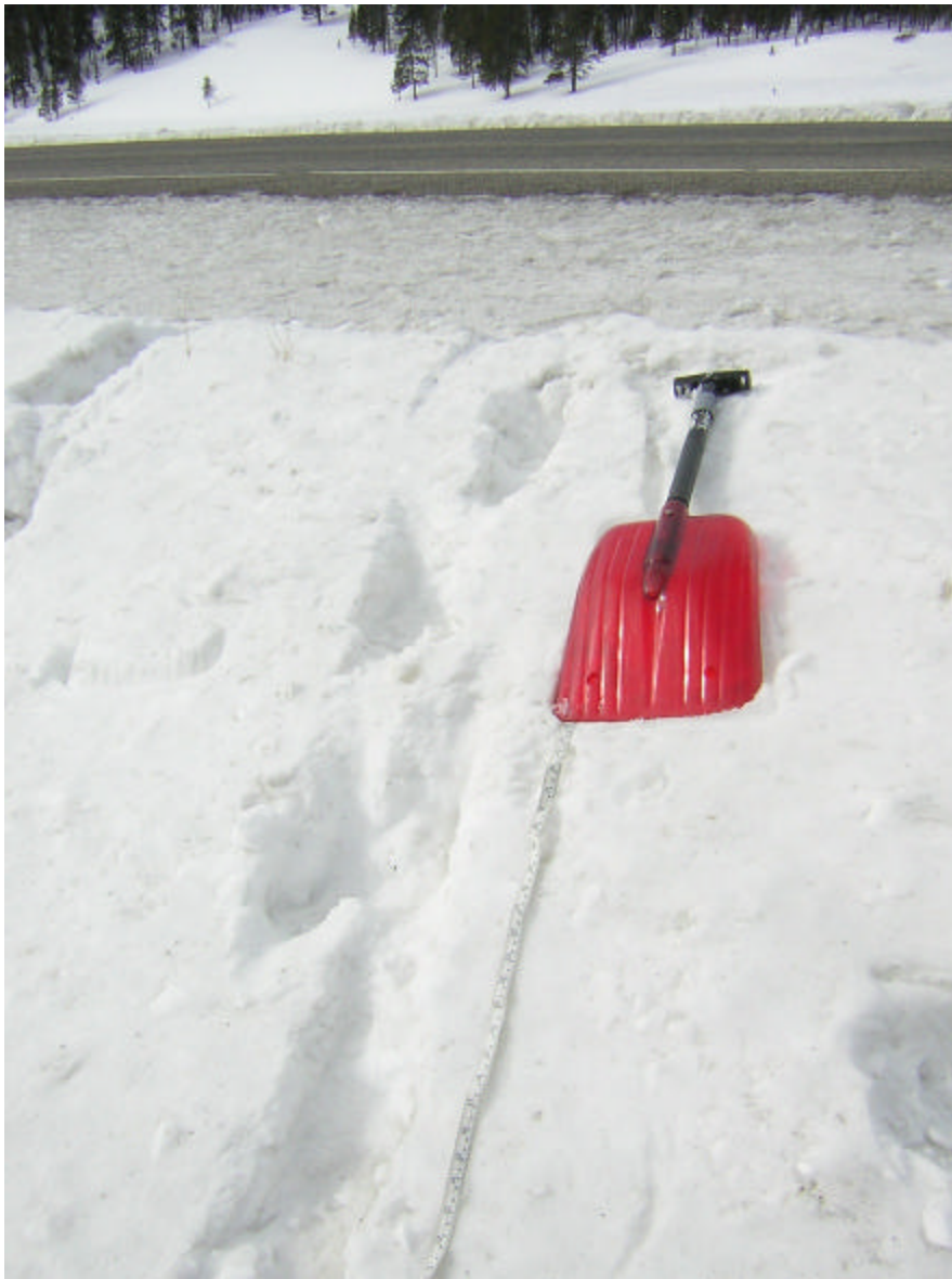
F133's tracks crossing US191 near Snowslide Creek in YNP.

The kit we captured last spring, F133, is currently dispersing. F133 spent the majority of last summer in the north end of the Gallatin Range. Beginning in the fall, she started spending more time in the southern portion of the Gallatin. In late February she began showing signs that she might disperse with a move to the southern tip of the Gallatin Range. Her first move outside the Gallatin was to the Madison Range across US Highway 191 in Yellowstone National Park (YNP). We were able to document the location where she crossed back into the Gallatin Range a few days later. After a short stay in the southern Gallatin, her next location was in the Thorofare Creek area southeast of YNP. We will attempt to monitor her throughout her dispersal.