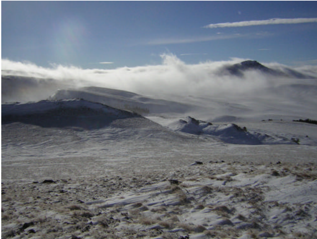
Winter on top of the Gravelly Range, Montana.

121 Trail Creek • Ennis, MT 59729 binman@wcs.org • kinman@wcs.org • tmccue@wcs.org • mpackila@wcs.org