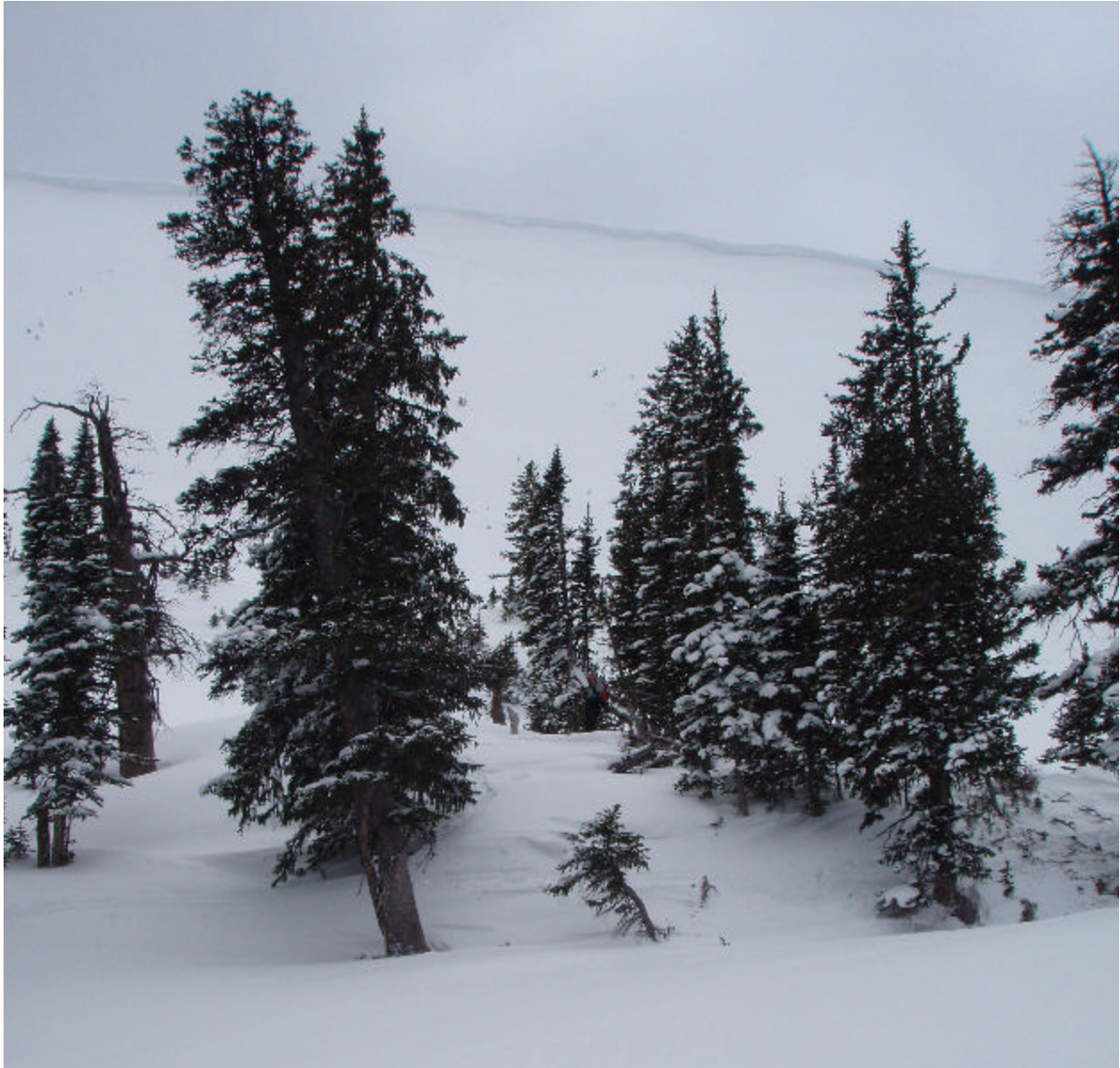
Bob Inman and Tony McCue determined the location of F121's natal den in the Gravelly Range. Bob Inman is near the den in the center of the photo.

We are also searching the north end of the Teton Range for a densite from the female we believe is occupying this area. Other areas scheduled to be searched for possible densites are the Snowcrest, Gallatin, and Snake River Ranges.