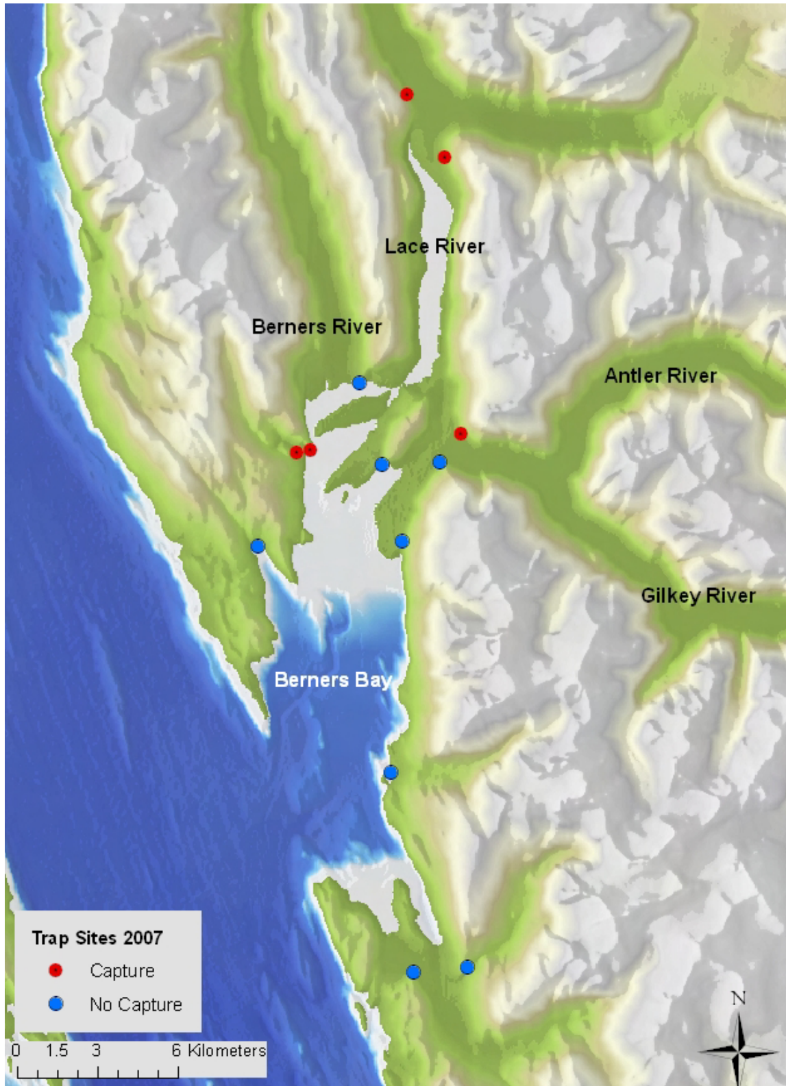
Figure 3. Wolverine trap locations in Berners Bay, Alaska, 2008.