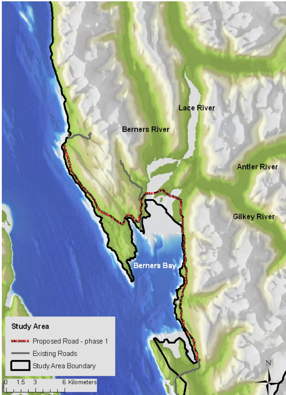
Figure 1. Juneau Access study area in northern Southeast Alaska, showing proposed and current road routes.