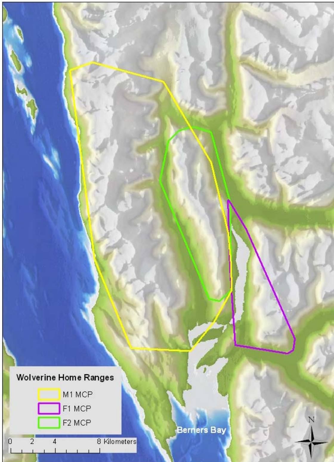
Figure 5. Home range of 3 wolverines in Berners Bay, Alaska; polygons generated from points collected from 3/21/08 to 5/10/08.